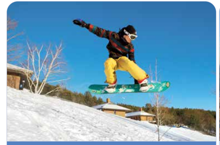
Let it snow! Vermont is paradise for skiers and snowboarders. You can practice on