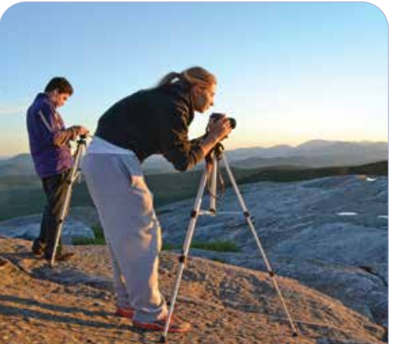
The outdoors become your classroom, like this photography class in New Hampshire's White Mountains.